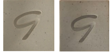
CC532 • Umpqua White