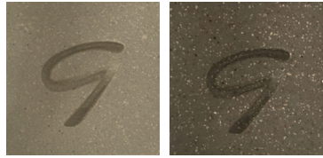
CC506 • Cookspride