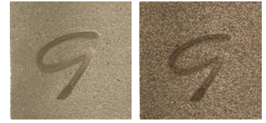
CC512A • Three Finger Jack Architectural