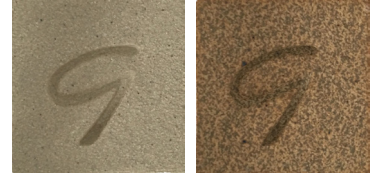
CC512 • Three Finger Jack