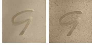
CC518 • G-Mix 10