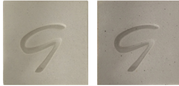
CC502 • Mt Hood Porcelain