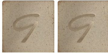
CC518G • G-Mix 10 with Grog