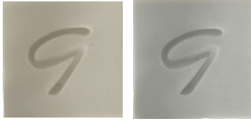
CC517 • Crystal Springs Porcelain